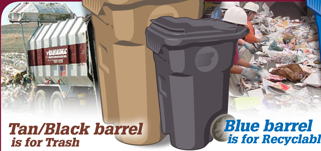
Tan/Black barrel is for Trash

CAUTION Please keep children from playing near barrels at all times.