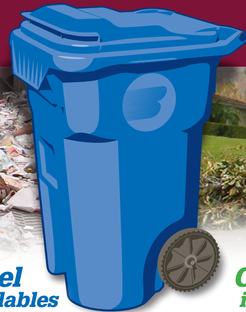
Green barrel is for Green Waste

Periodically we update the list of what is an acceptable recyclable item. However, just because an item is not on the list doesn't mean it's not recyclable! Give us a call and we will check it out!