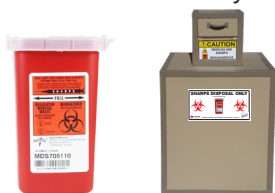
Sharps Drop-Off Box

Dispose of SHARPS containers into the SHARPS Drop-Off box located at Yucaipa Police Department at 34144 Yucaipa Blvd., Yucaipa CA.