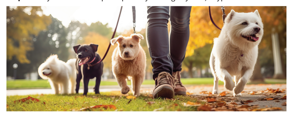
Thanks for being a responsible pet owner and contributing to a beautiful San Bernardino County.

Step 4: Use your canister to pick up after your dog anytime, anyplace!